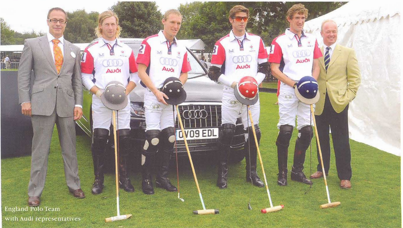
England Polo Team with Audi representatives